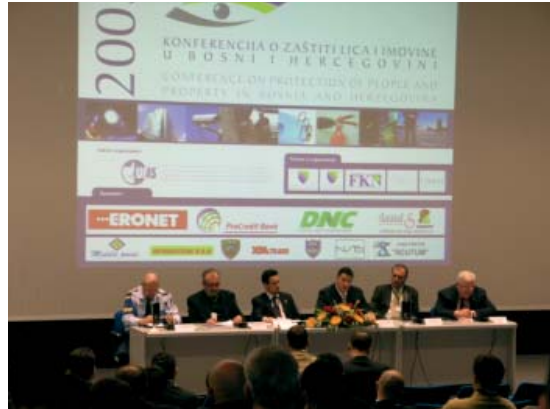
'Conference about the protection of person and property in BiH' 20 December 2005

elsewhere. In too many cases companies were found to have inappropriate affiliations (for example with political parties or criminal groups), to employ untrained staff, or to engage in bad practice. Formal regulation of the sector was also found to diverge widely: although most countries in the region now have specific legislation to regulate the industry, problems with the effective implementation of these laws and with the broader oversight of the sector were numerous. In those cases where companies had chosen to self-regulate by forming trade associations and agreeing codes of conduct this was seen to have helped in raising standards. For their part client organisations could probably do more: the limited amount of information available on the procurement practices of commercial and public sector clients suggested that contracts are often awarded on an informal basis, or on grounds of cost alone.